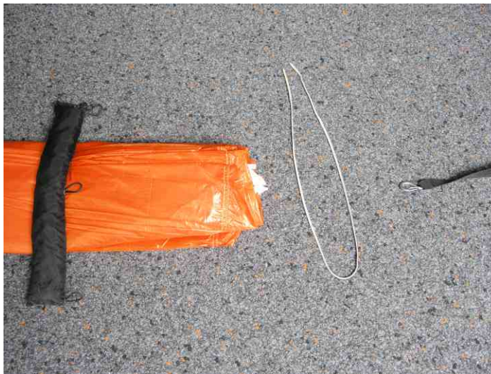
9. Remove the packing cord!