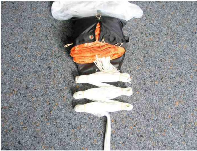
13. Bundle the lines in 3x3 "8-shapes". Do not bundle the last 60cm of the lines.

Attention: You have to use new rubber bands for the line-bundles and the deployment bag everytime the parachute is packed.