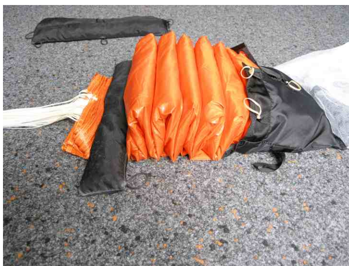
11. Fold the rest of the canopy in small S-folds and place it in front of the deployment bag.