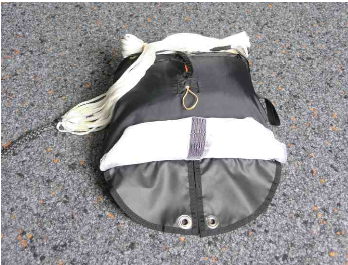
15. Roll in the drogue chute.