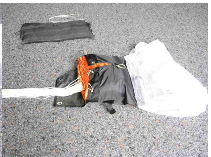
12. Put the S-folded canopy in the deployment bag.