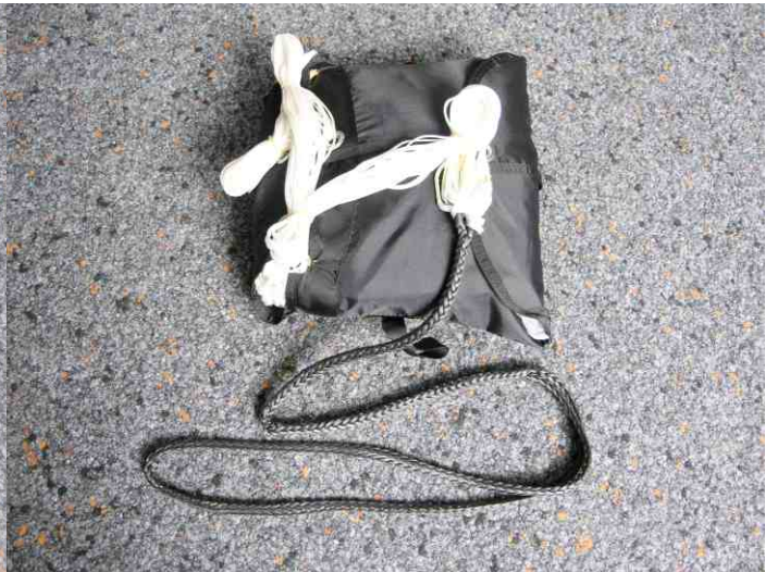
16. Close the flaps of the drogue parachute with the rest of the lines.