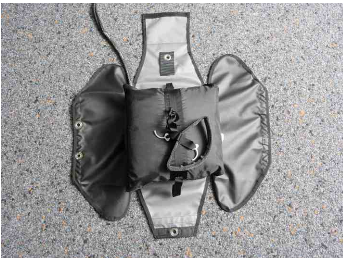
1. Connect the release handle at the loop in the middle of the deployment bag. Place the bridle at the side of the container which you prefer.