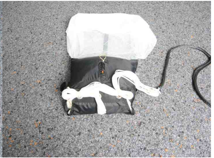
14. Close the deployment bag with the lines. First in the middle then the sides. The last 30cm lines are used to close the drogue chute.

Attention: You have to use new rubber bands for the line-bundles and the deployment bag everytime the parachute is packed.