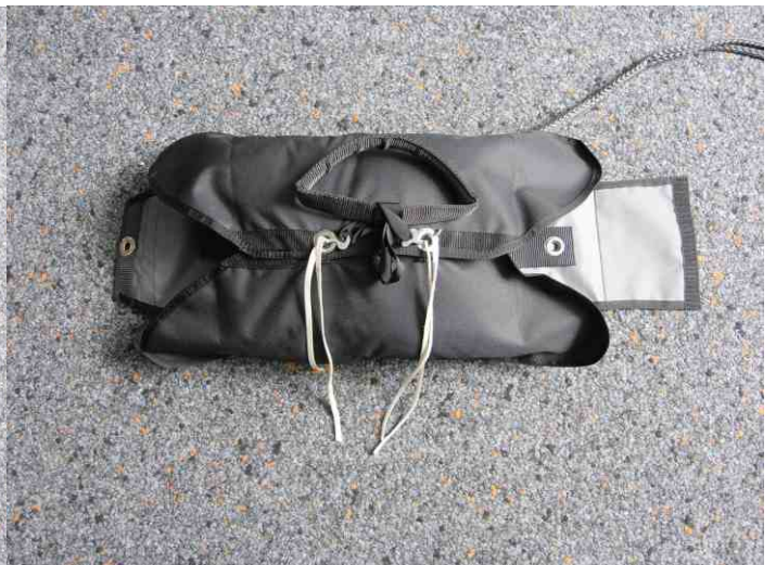
2. Close the two lateral flaps of the outercontainer with two packing-cords and closed it with the pins of the handle provisionally.