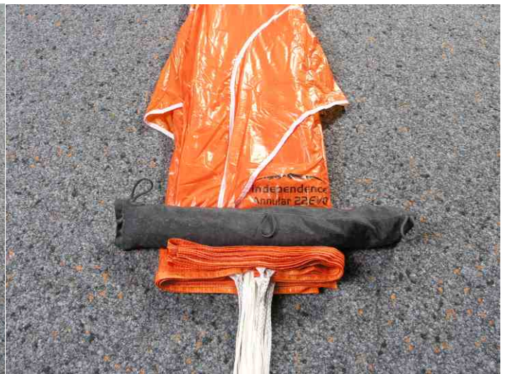
8. Fold the parachute like a "S", and pull out the Ram-Air-Pockets a little bit to the side.