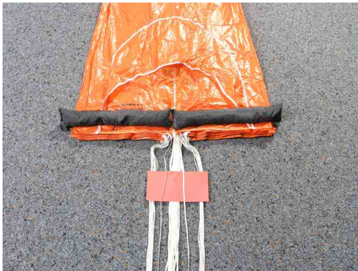
7. Check that line 1 and 20 (Annular EVO 20) and the center line are not twisted and running free. (Annular EVO 22/22HG: 1 and 22; Annular EVO 24/24HG: 1 and 24; Annular EVO Tandem/ Tandem HG: 1 and 30)