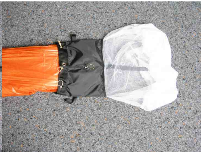
10. Stow the top canopy into the deployment bag.