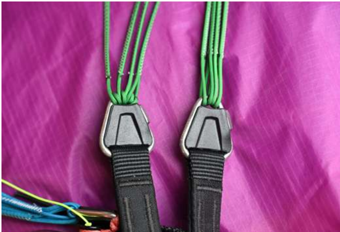
Left: loops on maillons; Right: loops released

All BGD gliders are rigged from new with loops on the maillons of the C lines (and D lines if any) plus the stabi line. The loops are there so that they can be released to compensate for any shrinkage of the back lines as the glider gets older.