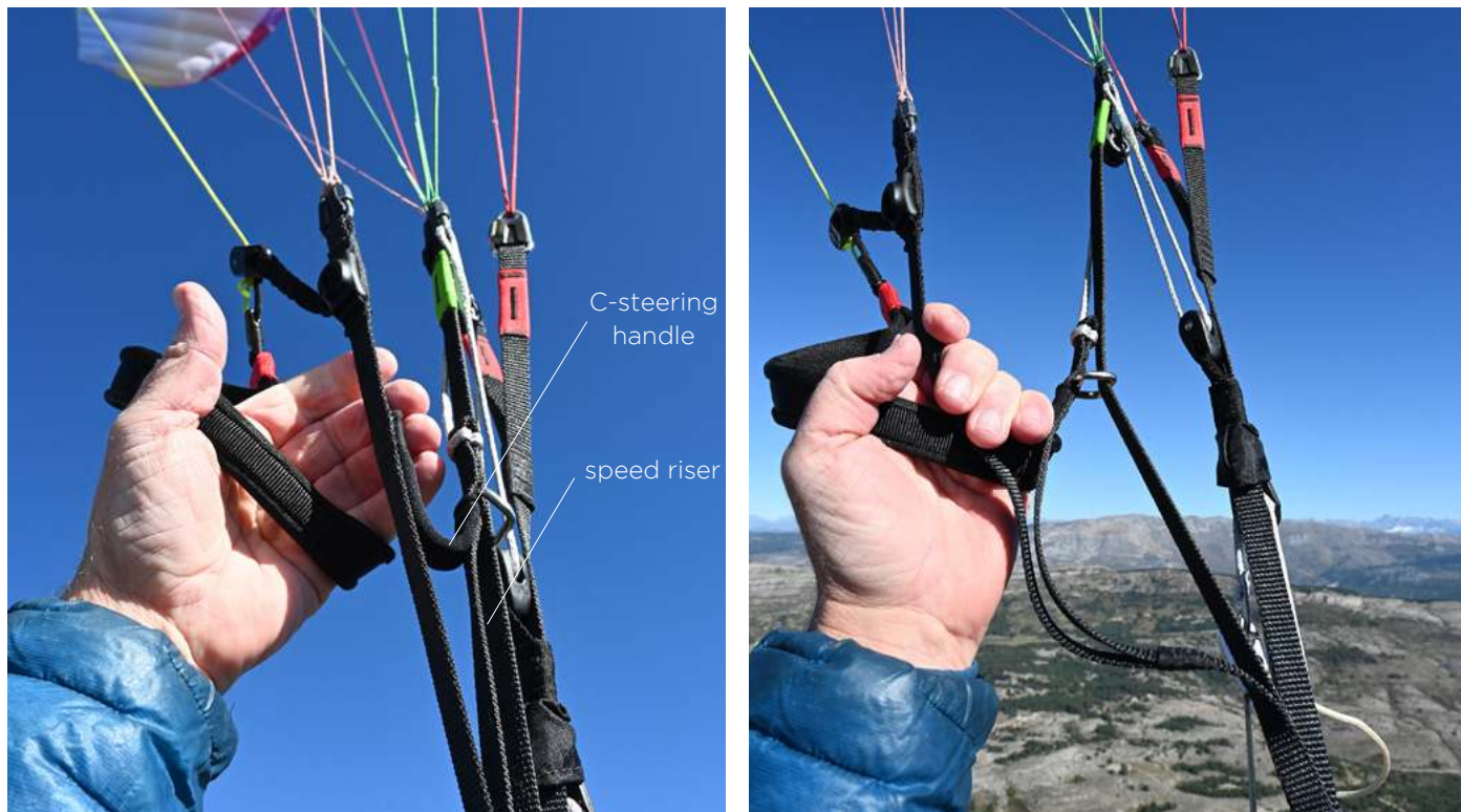
FIG. 1: Keeping the brake in your hand, grasp the C-steering handle with your fingers