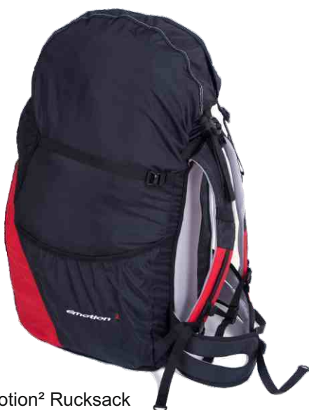
Emotion 2 Rucksack