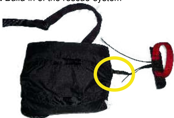
Connection to the Handle