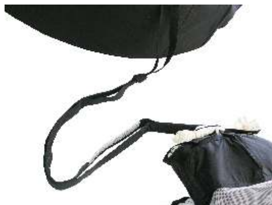
Connection to the Harness