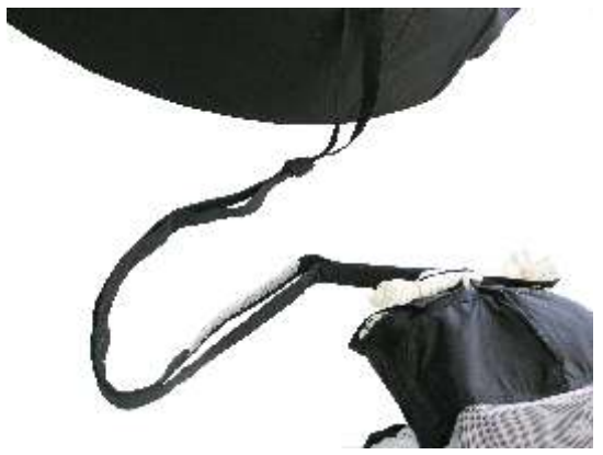
Connection to the Harness