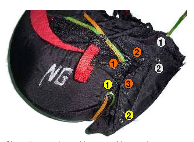
Close the container with two packing cords. Order: