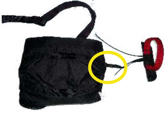
Connection to the Handle