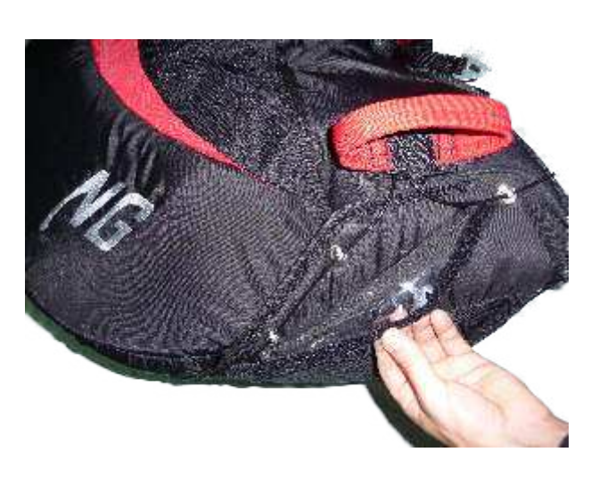
After closing the container, by putting in the pins, remove the packing cords and put the release-handle in the therefore assigned pockets