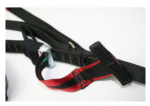
Fig. 5 Trimmer closed

Never fly with trimmers fully open in turbulent conditions!