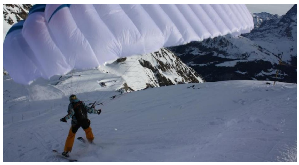
Fig. 8 Ueli Kestenholz launches with the brakes applied only about 30%