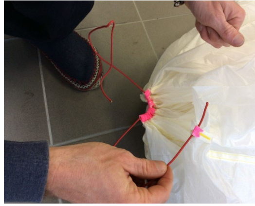
Sort out the suspension lines.