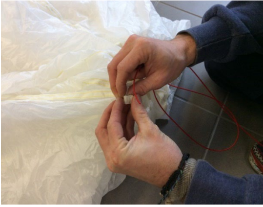
Attach the line to a stable fixed point.